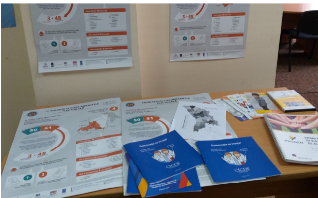
IRI observers found voter education materials at a library in Riscani.