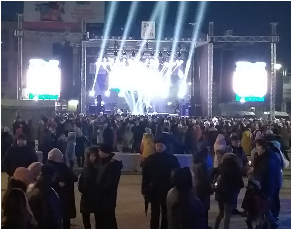
In DEC #45, IRI observers witnessed a party-sponsored public concert . (January 2, 2019)